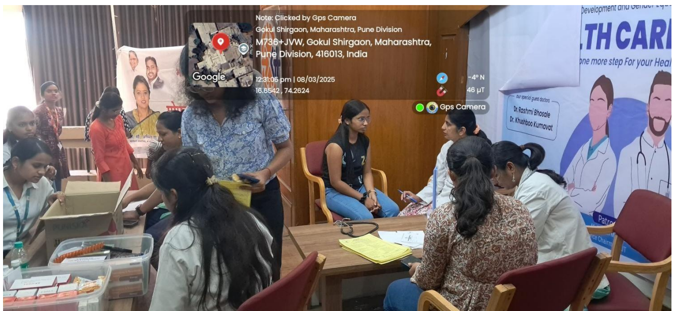
Health care check-up by doctors