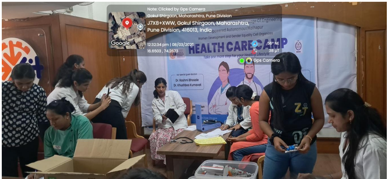
Health care check-up by doctors