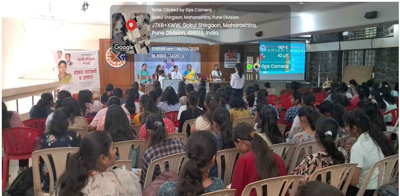
Audience of Health care camp